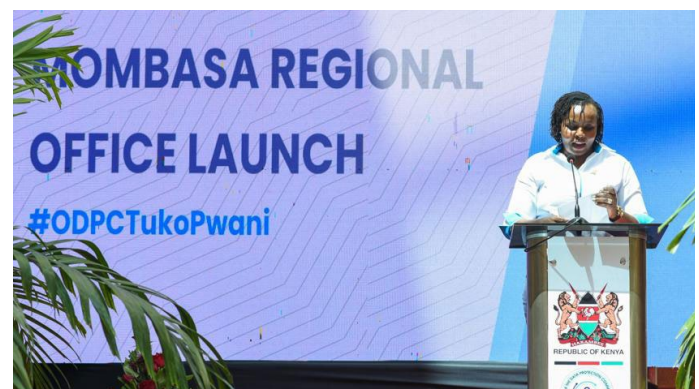
The Data Commissioner speaking at the Mombasa Regional Office launch

The Office plans to establish its presence across thirteen additional regions across the country.