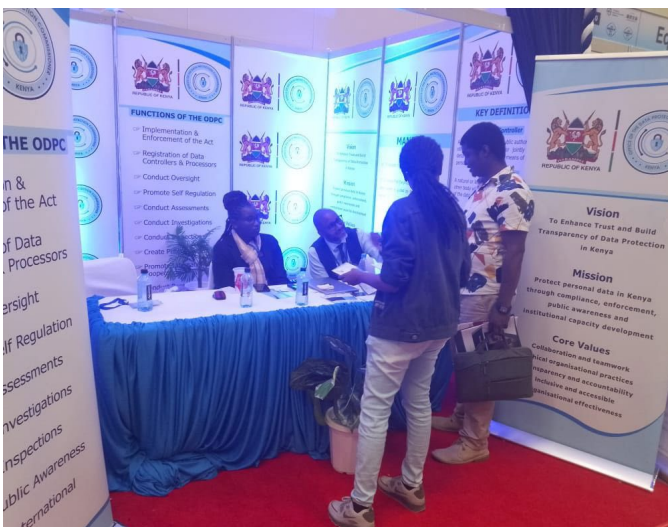
ODPC Exhibition at the Kenya Investment Authority's exhibition and trade conference