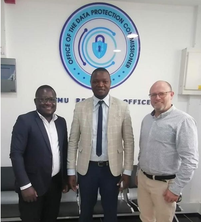
ODPC Kisumu Regional Principal Officer hosts a delegation to understand Data Protection and the role of the office