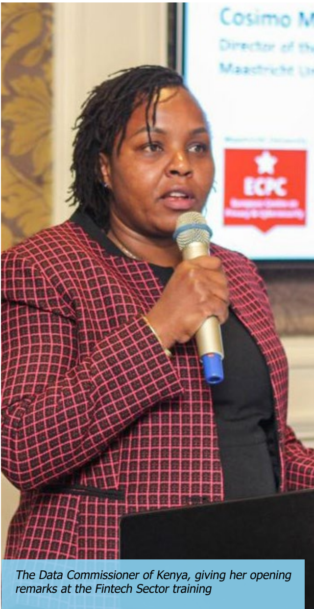
The Data Commissioner of Kenya, giving her opening remarks at the Fintech Sector training