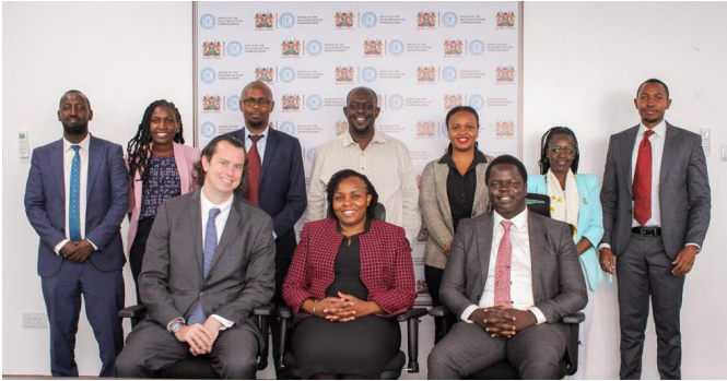
Data Commissioner led a team from ODPC during a courtesy call with Open Institute