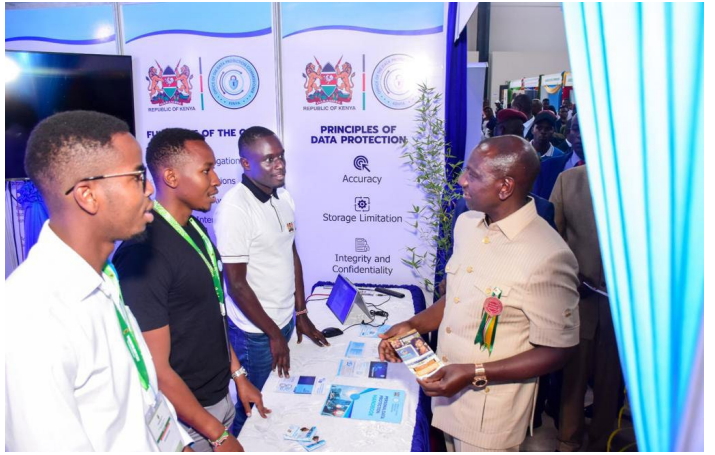
Nairobi International Trade Fair