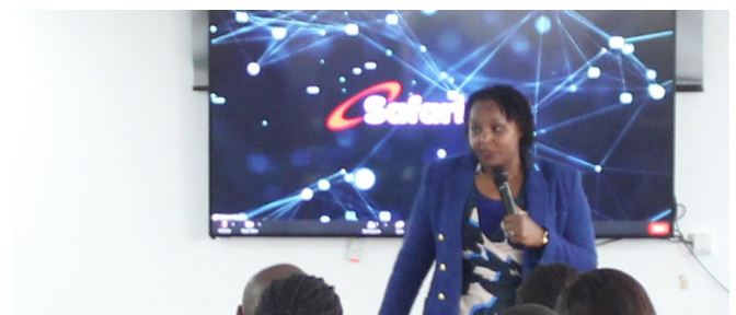
The Data Commissioner of Kenya, leads a team from ODPC in a knowledge-sharing session with Safaricom