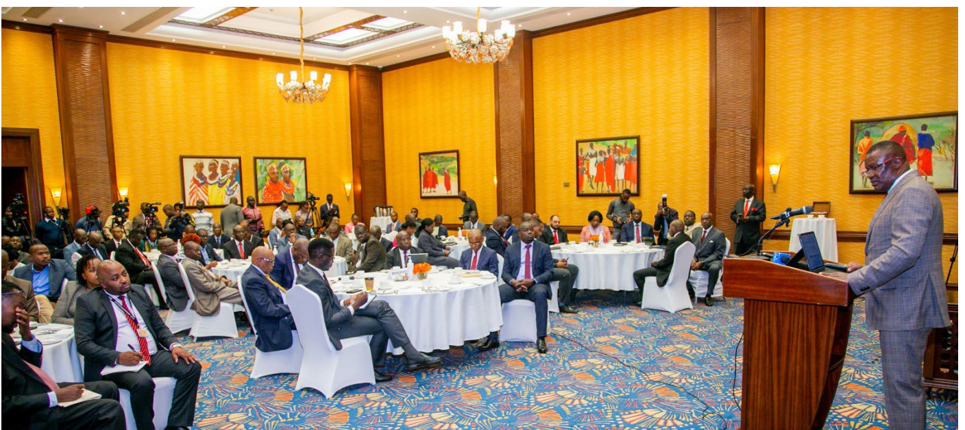
The Cabinet Secretary, Ministry of Information, Communications and Digital Economy in a breakfast forum with media editors

ODPC is glad to have digitized its services since inception and having met the digitization of Government Services.