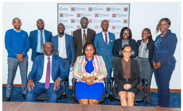
Commissioners from Advocates Complaints Commission pays courtesy call to ODPC