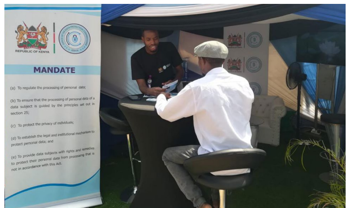
ODPC participated in the 2023 Mombasa International Show themed "Promoting Climate Smart Agriculture and Trade Initiatives."