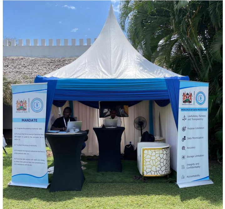
ODPC Exhibition at the Annual LSK conference