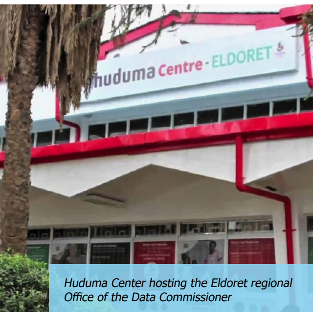
Huduma Center hosting the Eldoret regional Office of the Data Commissioner

The Office of the Data Protection Commissioner (ODPC) has expanded its services to Nyeri, Garissa, and Eldoret by establishing its presence in Huduma Centres in the respective towns.